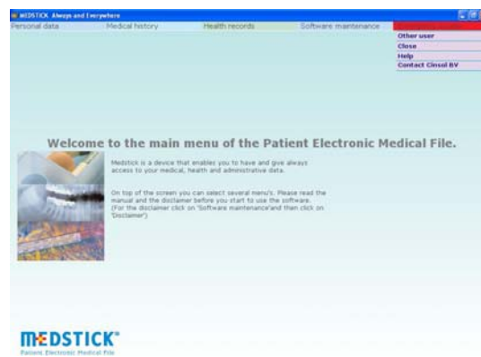
Overview of main menu

Amongst others, records are provided for: personal details; details of an illness; required emergency treatment; hospital admissions; medication(s); therapies; dental records; birth details; height / weight growth curves; vaccinations; 'stopping smoking' overviews; weight details; and a medical encyclopedia.