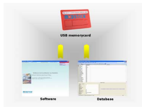
Schematic representation of Medstick

The product consists of hardware (the data storage device), a software program, and a software database.